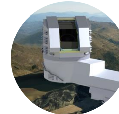
Rubin Observatory 0.1