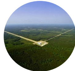
GW Detector 0.1