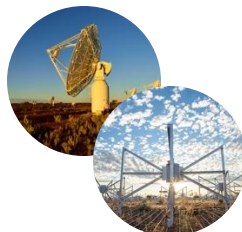
ASKAP & MWA 0.1