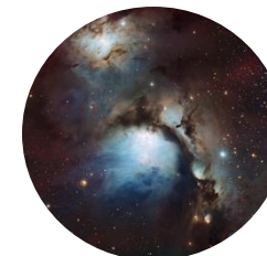
Staff support/guidance 0.5