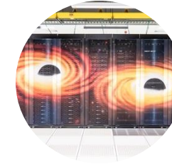
Data & Computing 0.4