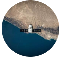
Industry Engagement 0.5