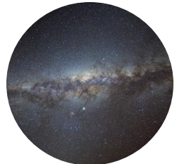
General Comms 0.8